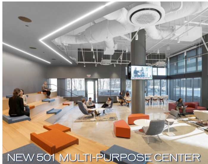
NEW 501 MULTI-PURPOSE CENTER