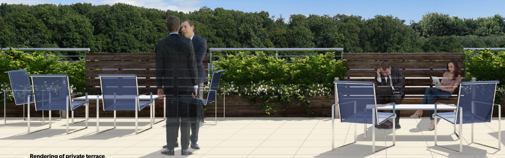
Rendering of private terrace