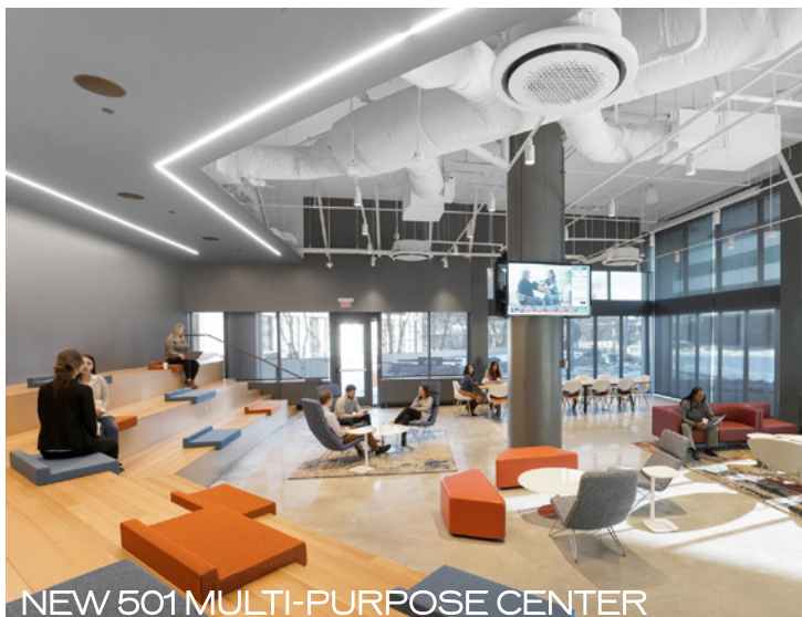
NEW 501 MULTI-PURPOSE CENTER