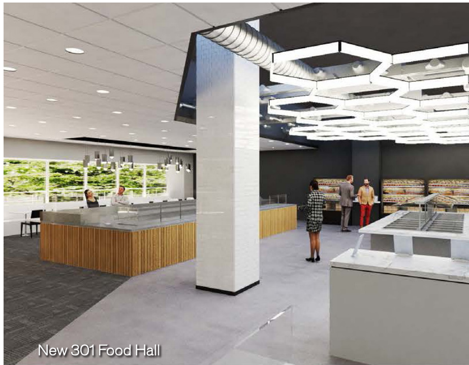
New 301 Food Hall

More updates on the additional improvements underway!