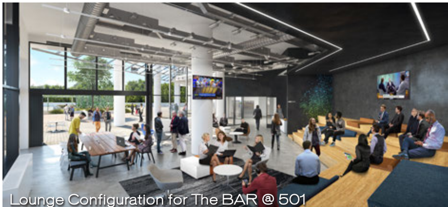
Lounge Configuration for The BAR @ 501