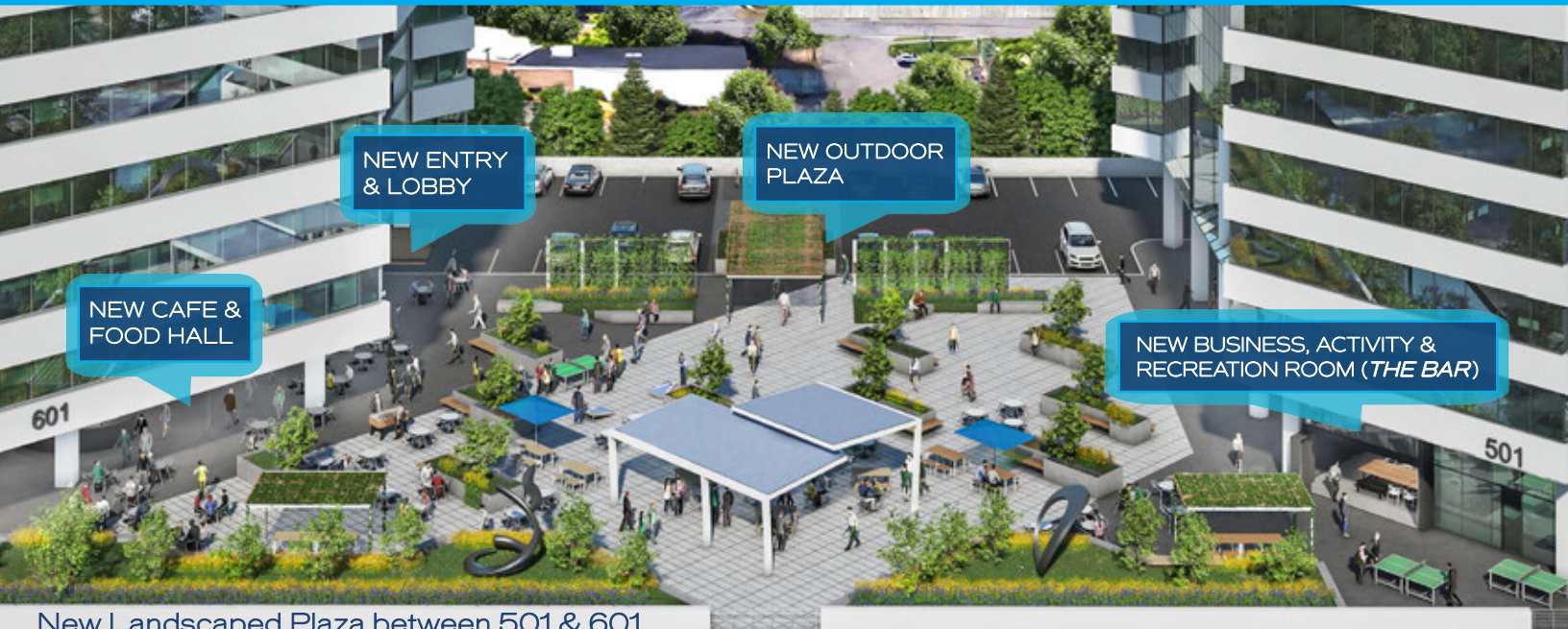
New Landscaped Plaza between 501 & 601