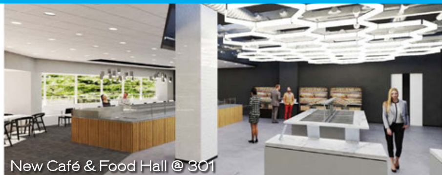
New Café & Food Hall @ 301

Our capital improvement plan is moving along! We're very excited about all the changes coming to M7 as we work to enhance your experience at the park. The renovation program includes an elegantly landscaped new outdoor plaza between 501 and 601, new cafés, as well as our brand new destination for business, activity & recreation: The BAR, opening this December! Stay tuned for more on the new and improved M7!