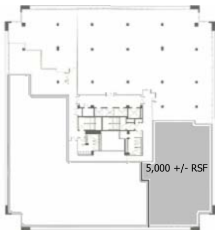
Building 101 - Second Floor - Key Plan